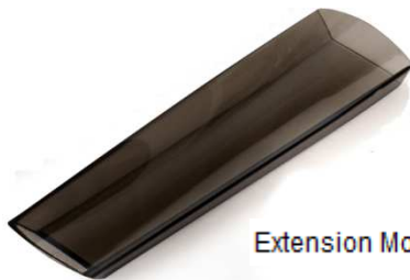
Extension Mouth Connector