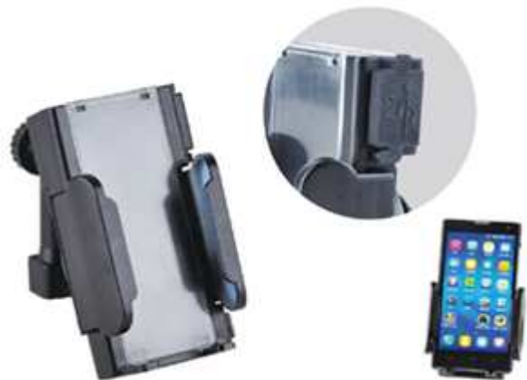
USB Charger for Motorbike with Mobile Phone Stand