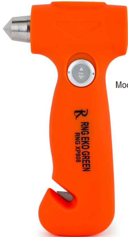
Model: RNG XP808