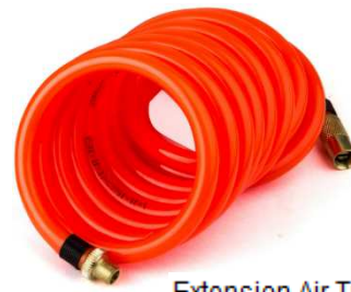
Extension Air Tube