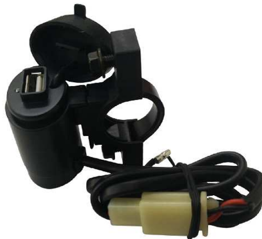
Standalone USB Charger for Motorbike