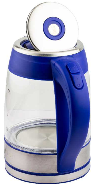
High Quality Glass Body