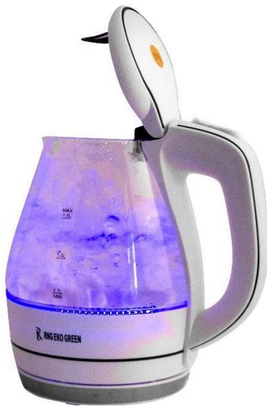
Easy Open & Close Lid