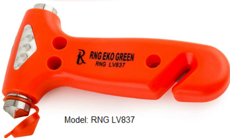
Model: RNG LV837