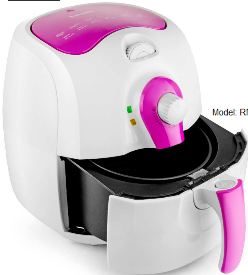
Model: RNG 5010