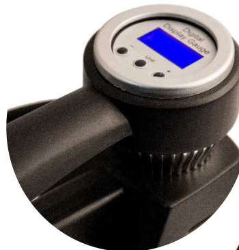
Digital Display Gauge