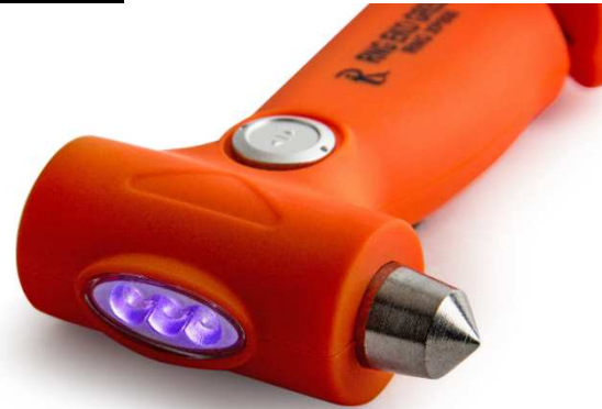
Dynamo Operated LED Light