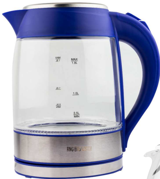
Model: RNG-1752 (1.8 L)