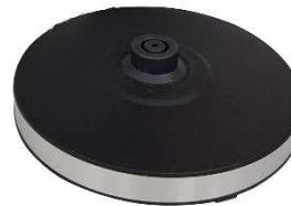
360° Cordless Pirouette Base