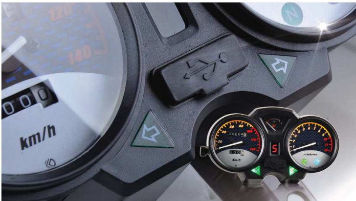
Motorbike Speedometer with USB Charger integrated