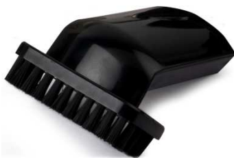
Dust Cleaner Brush