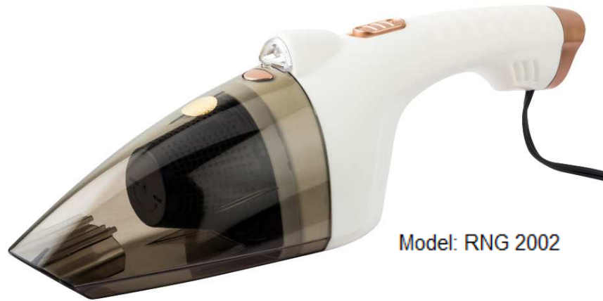
Model: RNG 2002