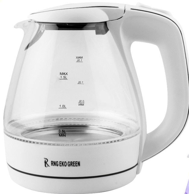
Model: RNG-1519 (1.5 L)