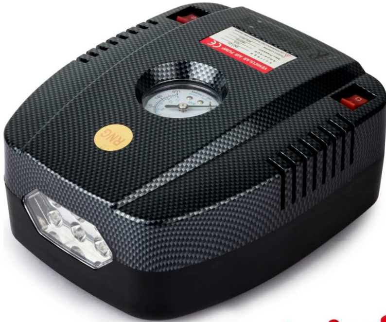
Model: 1301 B