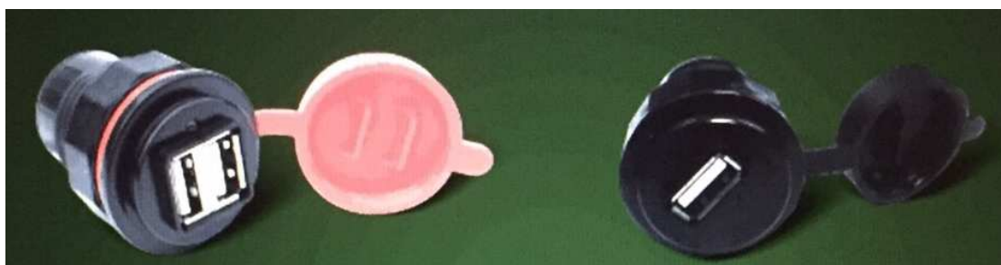
Screw Type USB Charger for Four Wheelers / Three Wheelers / Two Wheelers [Single/Double Socket]