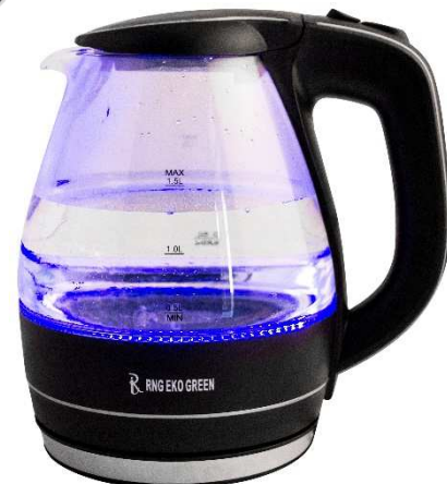
Blue LED Lighting