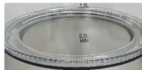
Hidden Heating Element