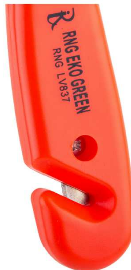
Seat Belt Cutter