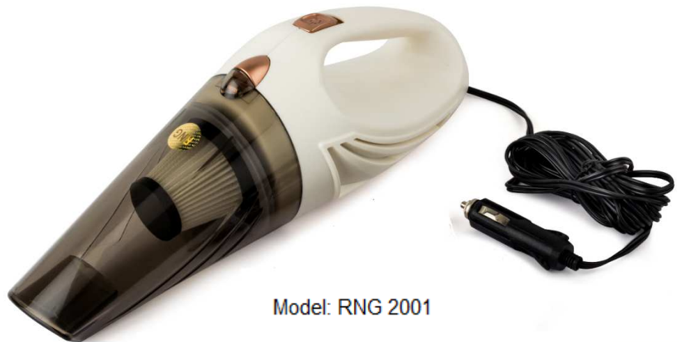
Model: RNG 2001